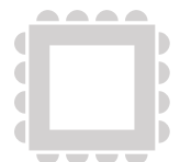
HOLLOW SQUARE SETUP